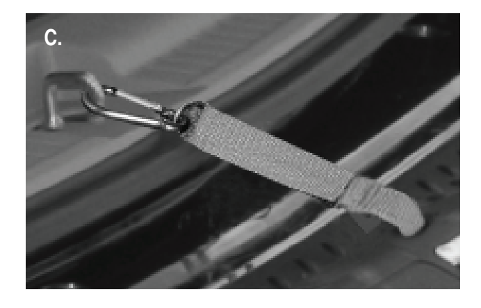
Step 3. If used on the rear entrance of a van or SUV, attach the security strap to the floor door latch, as shown (Figure C).