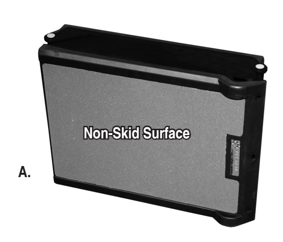
Step 1. Unfold ramp and place on firm surface with non-skid surface facing up (Figure A).