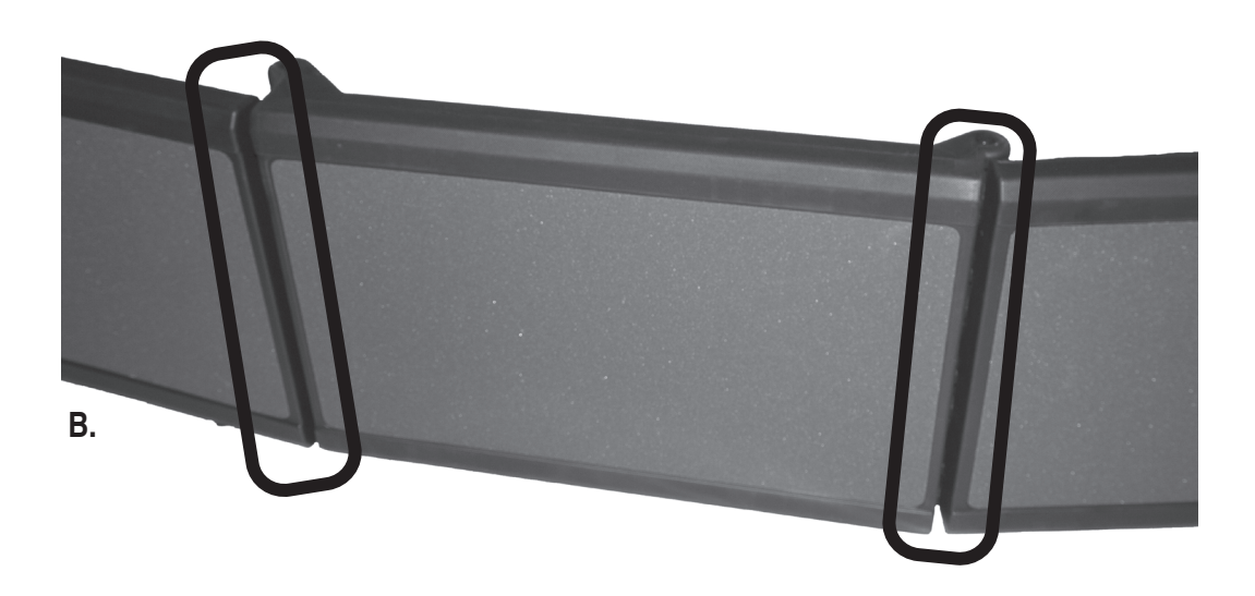
Step 2. Be sure the ramp is secure and all four corners are supported.

Watch for pinch points while unfolding ramp (Figure B).